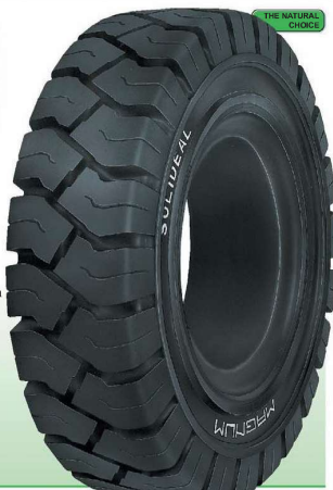
THE NATURAL CHOICE

Because Solideal uses only premium natural rubber, the Magnum will run at higher speeds over longer distances.