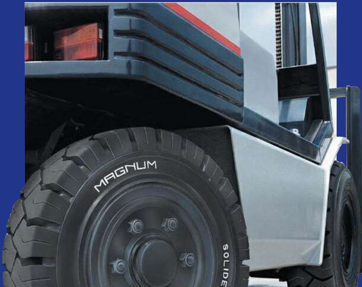
A MAGNUM FOR THE NEW MILLENNIUM